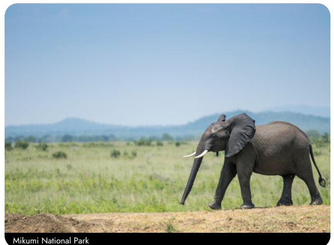
Mikumi National Park